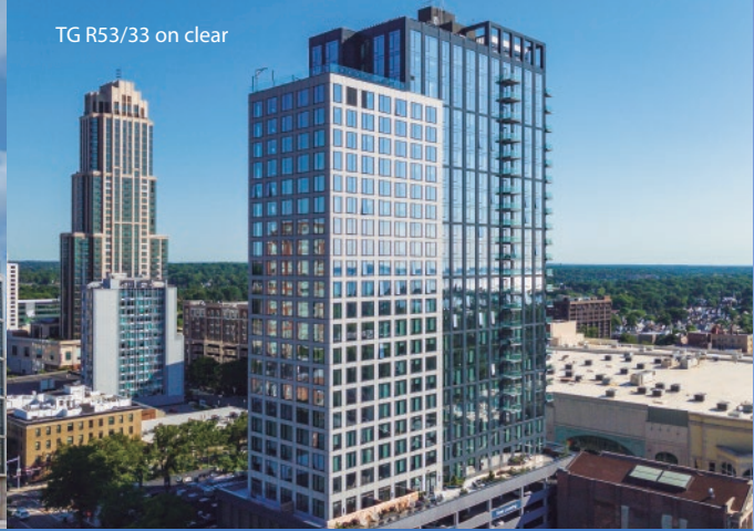
14 LeCount Place New Rochelle, NY TG R53/33 on clear