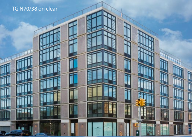
500 Waverly New York City, NY TG N70/38 on clear