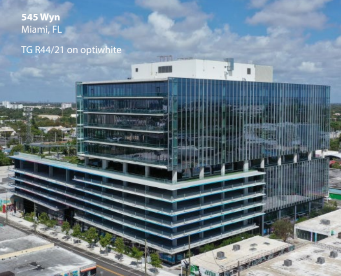
545 Wyn Miami, FL TG R44/21 on optiwhite